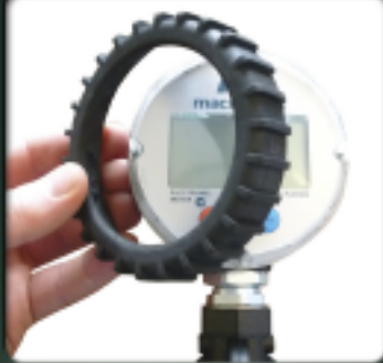
2. Remove rubber shroud