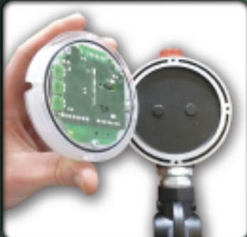
4. Carefully remove electronic module keeping rubber 'O' ring in place