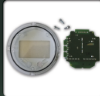
6. Carefully remove the PCB and set it face down on a soft cloth