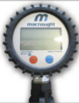
1. Gun display