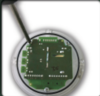
5. Unscrew the three PCB retaining screws