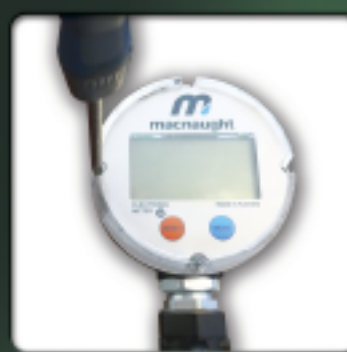
3. Unscrew four retaining screws