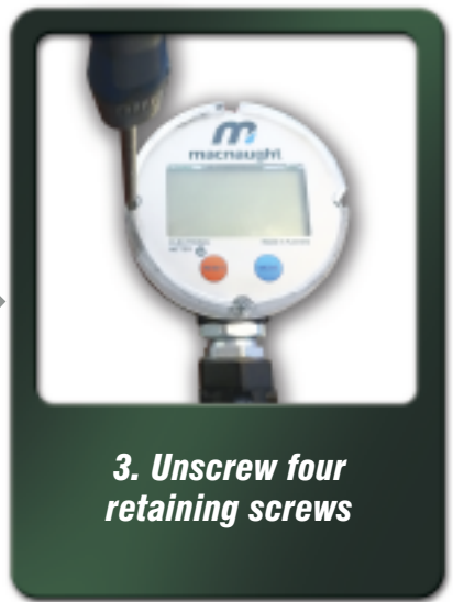
3. Unscrew four retaining screws