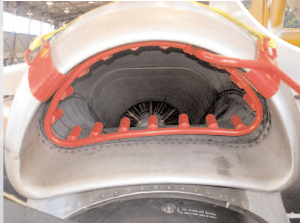
Below, on-site testing of the spray ring.

The use of these spray rings proved a success and Juniper was approached to take the development and manufacture a stage further. Consequently, Juniper made further spray rings for the Netherlands Royal Navy and also applied the same system to the T56 engines fitted in the Hercules aircraft, with their first customer being the Royal Netherlands Air Force.