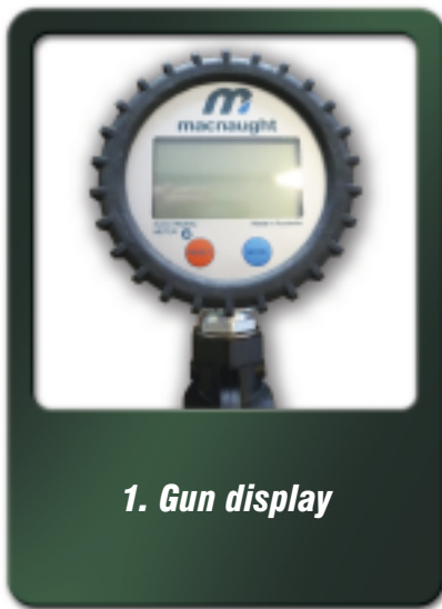
1. Gun display