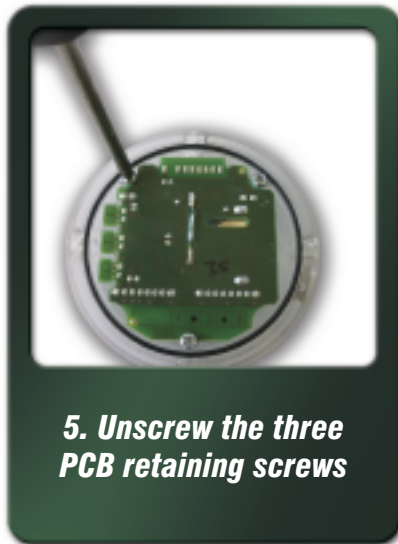
5. Unscrew the three PCB retaining screws