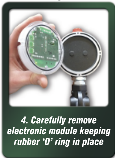
4. Carefully remove electronic module keeping rubber 'O' ring in place