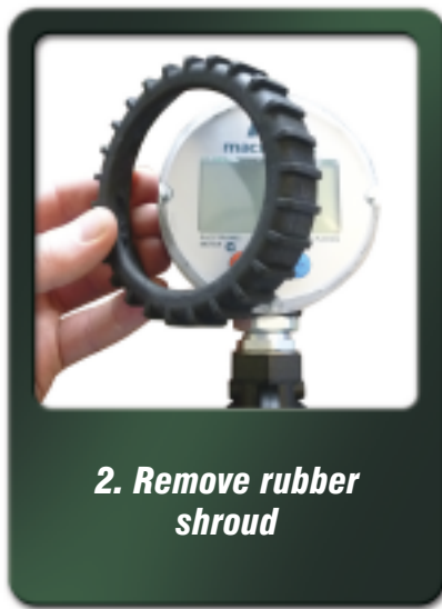
2. Remove rubber shroud