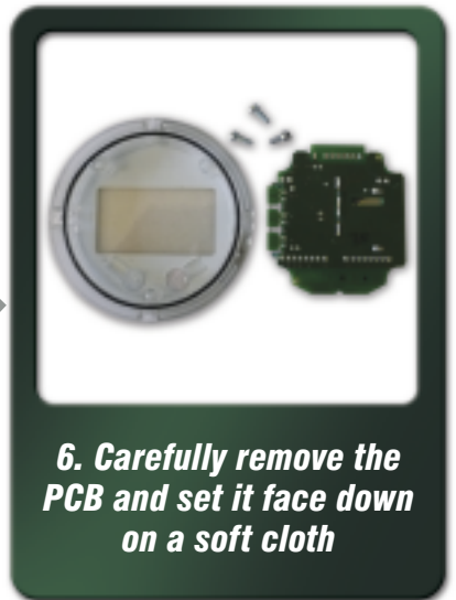
6. Carefully remove the PCB and set it face down on a soft cloth