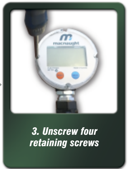
3. Unscrew four retaining screws